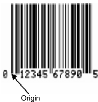
Figure 2. Barcode Reference Coordinates

The barcode origin is at the bottom of the leftmost bar as shown in the figure below.