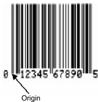
Figure 2. Barcode Reference Coordinates

The barcode origin is at the bottom of the leftmost bar as shown in the figure below.