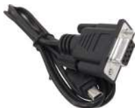
USB to RS232 Adapter 258238-001