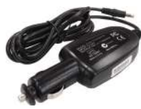
Vehicle Power Adapter 258240-001