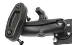
Forklift Mount Kit 258290-001