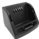
Single Bay Battery External Charger* 258314-001 Americas 258314-002 Europe 258314-003 United Kingdom