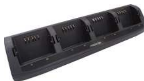
Quad 4-Battery Bay External Charger* 258234-001 Americas 258234-002 Europe 258234-003 United Kingdom