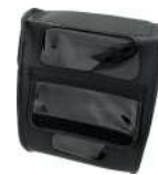
IP-54 Case Protector (Up to 6ft Drop) 258152-001