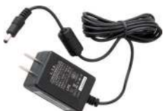
AC Single-Unit Charger* 258233-001 Americas 258233-002 Europe 258233-003 United Kingdom