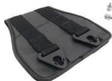
Velcro Belt Loop 258302-001