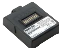
Lithium-Ion Battery 258235-001