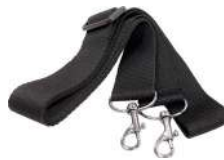
Shoulder Strap 258239-001